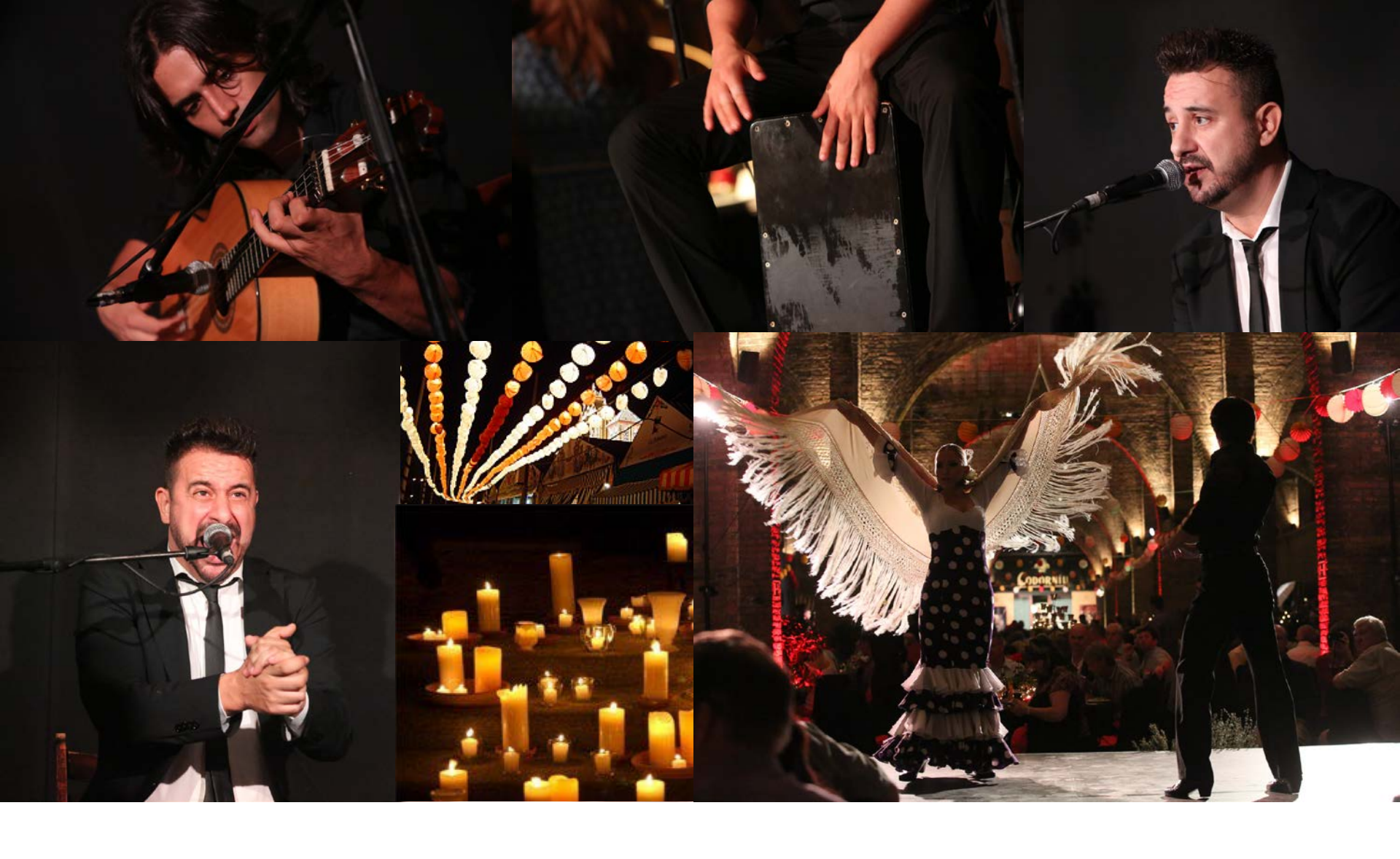
"Ladies and gentlemen, a big hand for our fantastic flamenco dancers"