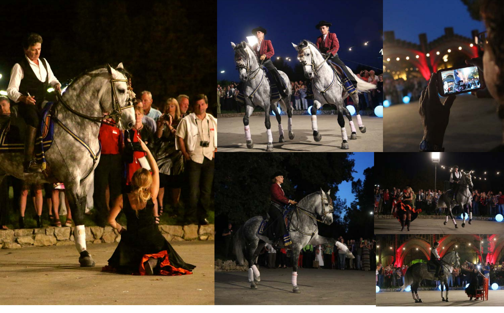
This is surely the most breath-taking show of all to finish off an evening that introduces our guests to irresistible Spain and her fascinating cultures.