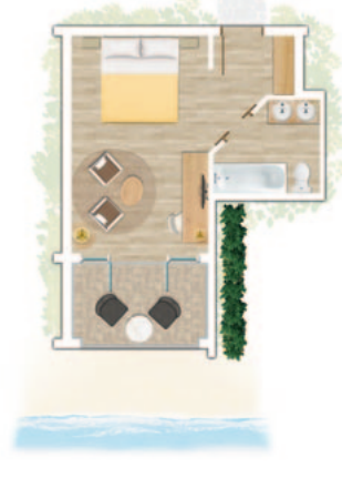
Standard Sea facing