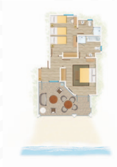
2-Bedroom Family Apartment