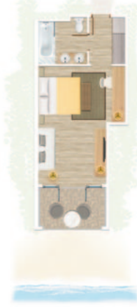
Superior Garden / Superior Sea facing