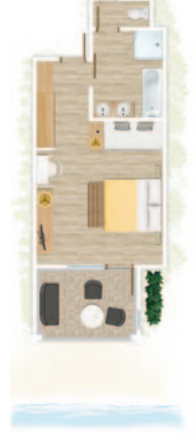
Deluxe Sea Facing Room