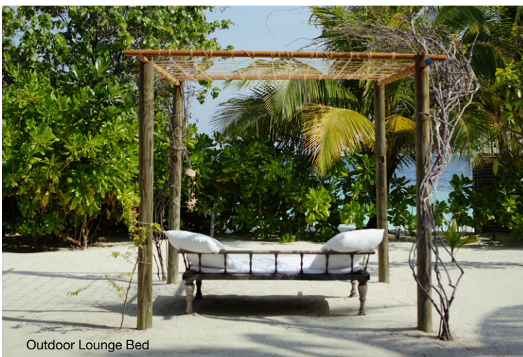
Outdoor Lounge Bed