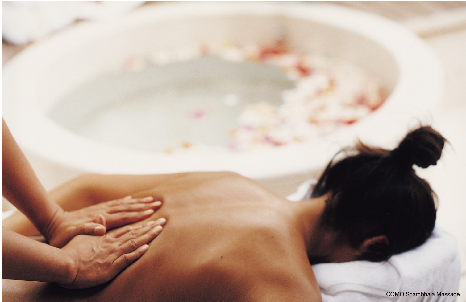
COMO Shambhala Massage