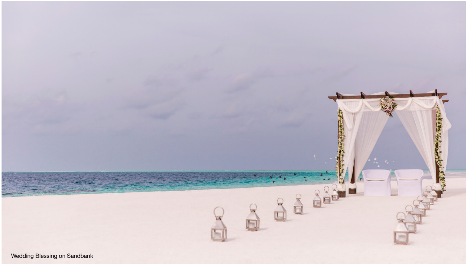
Wedding Blessing on Sandbank