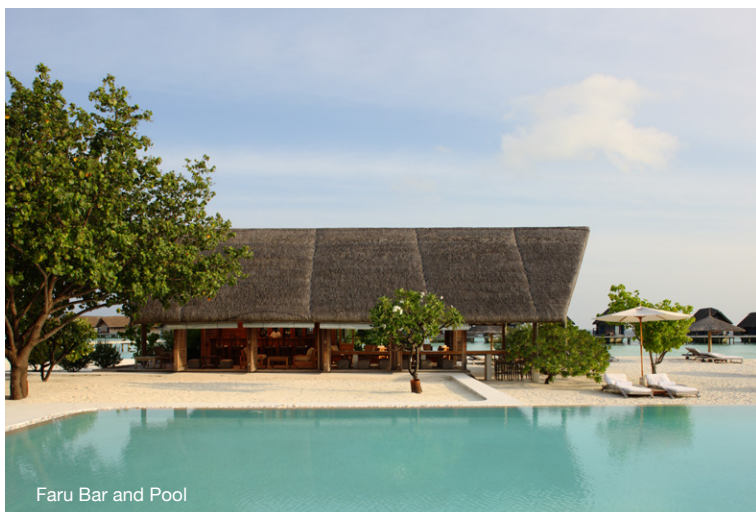
Faru Bar and Pool