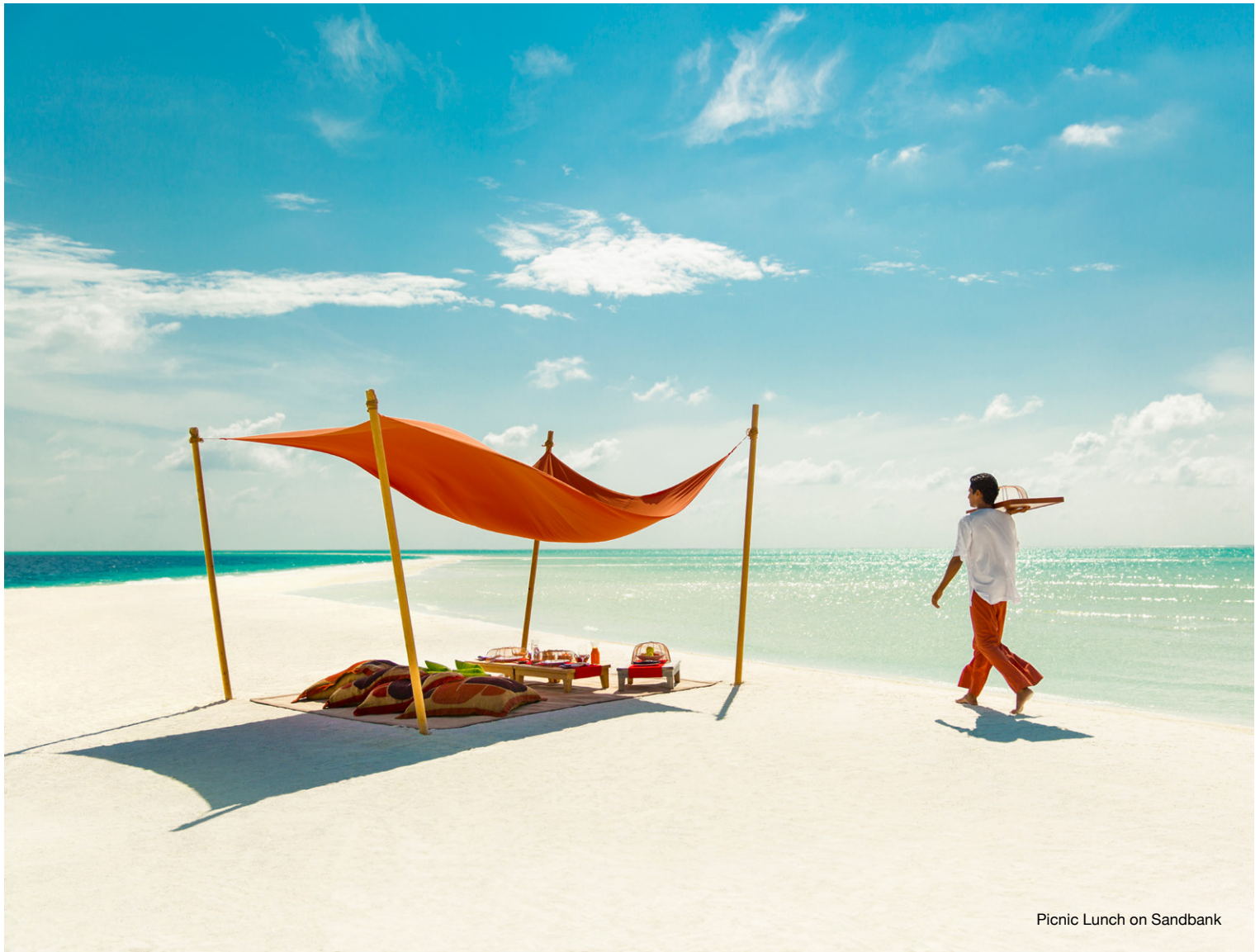
Picnic Lunch on Sandbank