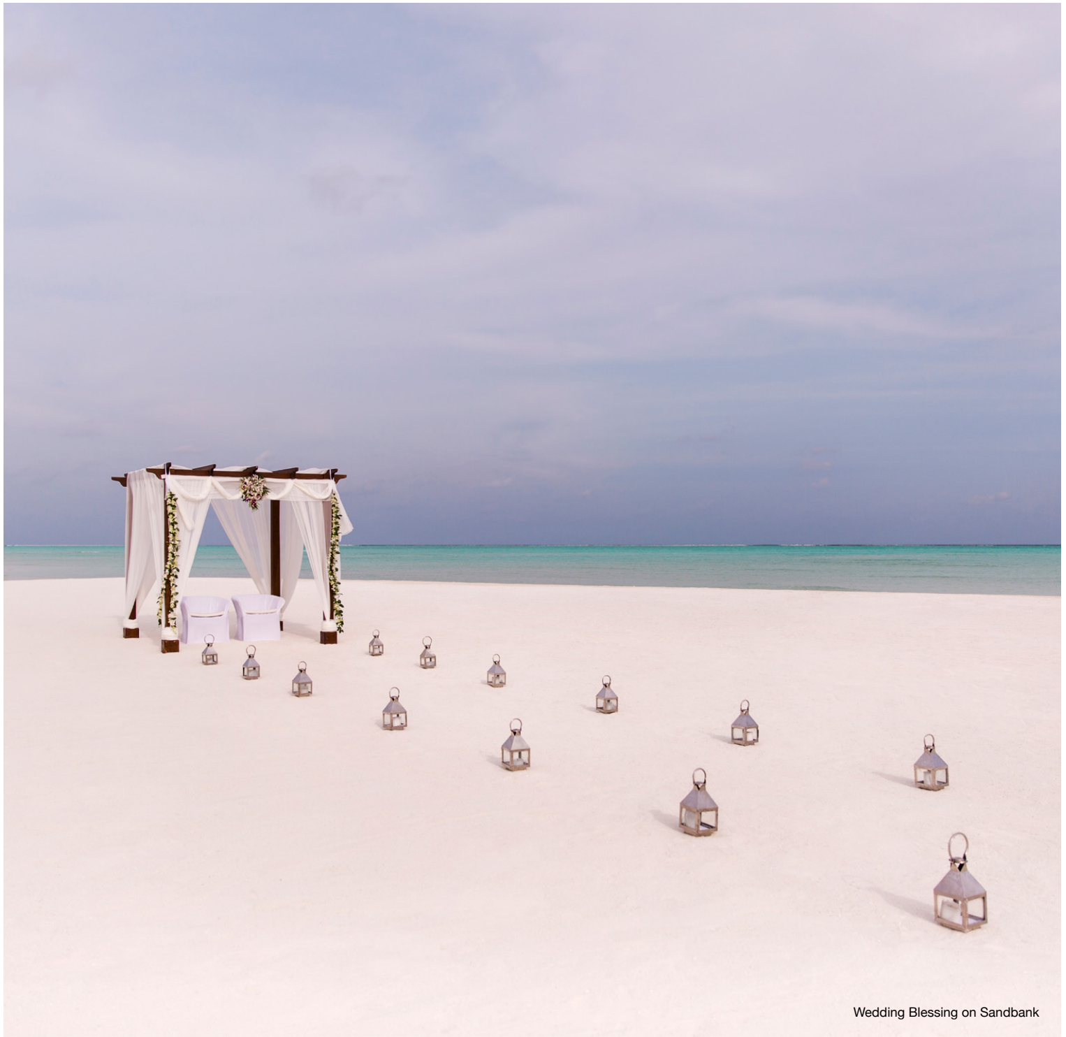
Wedding Blessing on Sandbank