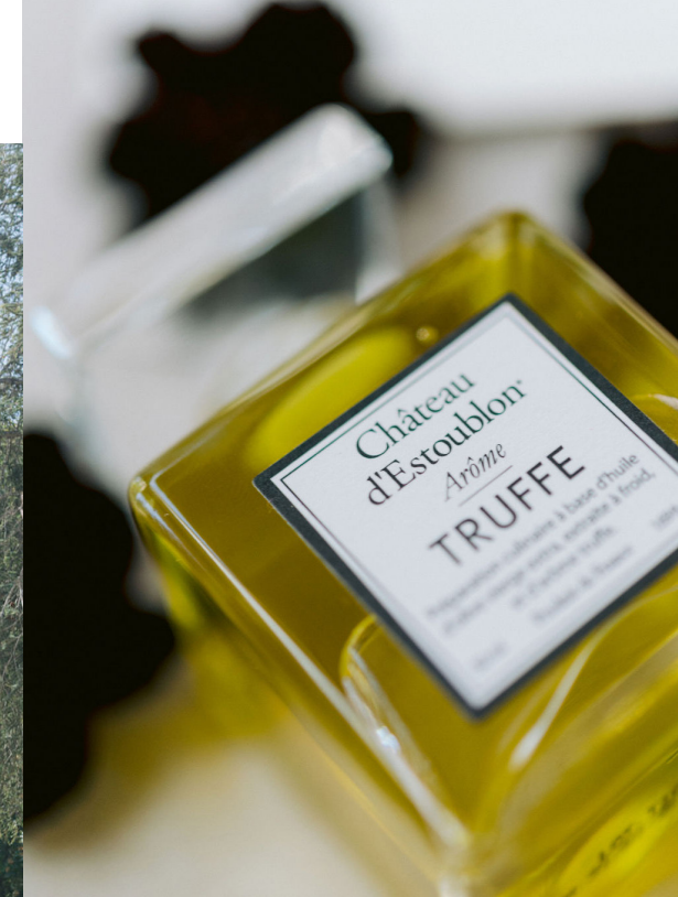
Awarded olive oil