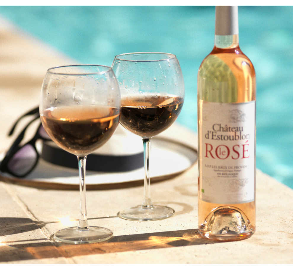
Estoublon rosé wine