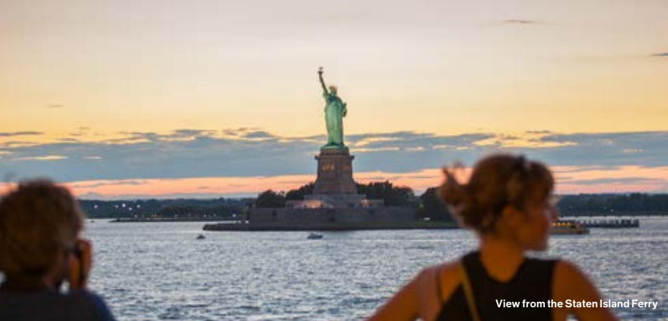
View from the Staten Island Ferry