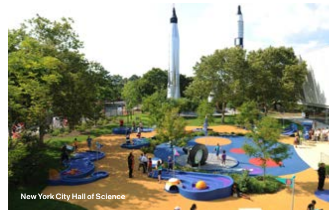
New York City Hall of Science