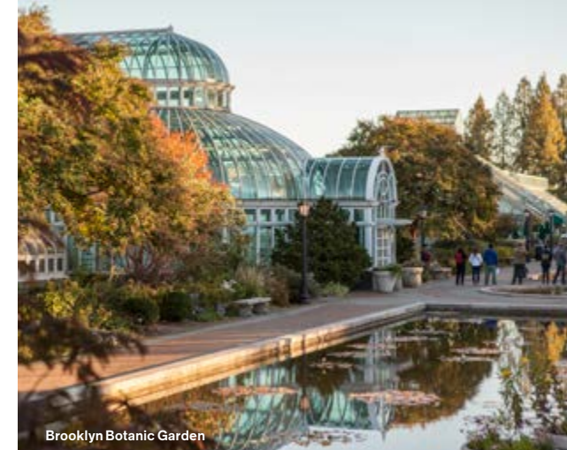
Brooklyn Botanic Garden