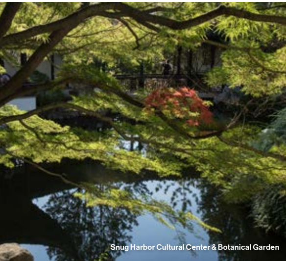
Snug Harbor Cultural Center & Botanical Garden