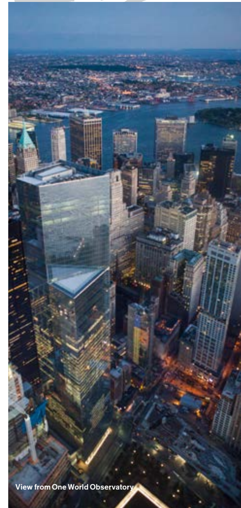
View from One World Observatory