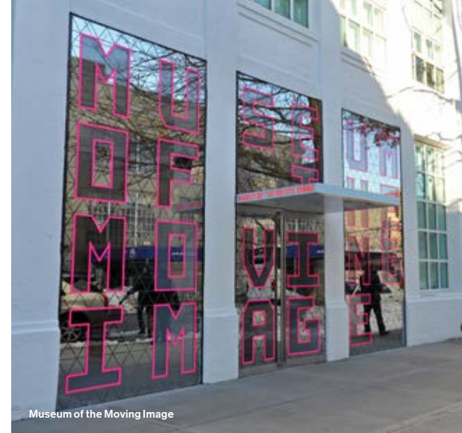
Museum of the Moving Image