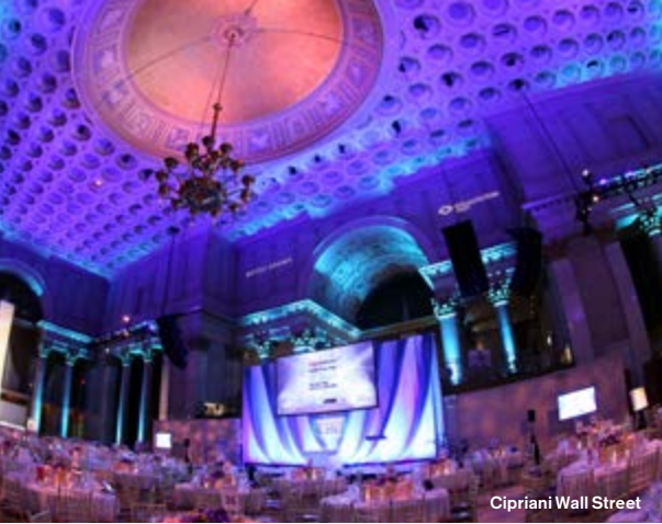
Cipriani Wall Street