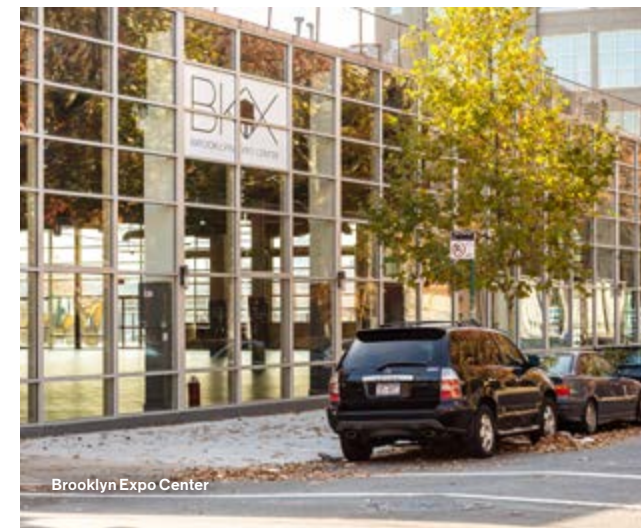
Brooklyn Expo Center