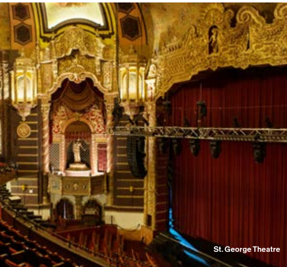
St. George Theatre

Staten Island is easily accessible via the Staten Island Ferry; free rides depart from Whitehall Terminal in Lower Manhattan. Your destination is St. George Terminal on the North Shore of Staten Island—an area undergoing major developments including the addition of New York City’s first retail outlets.