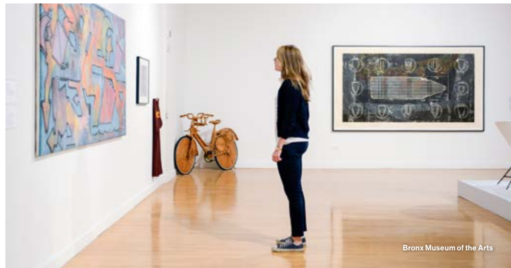
Bronx Museum of the Arts