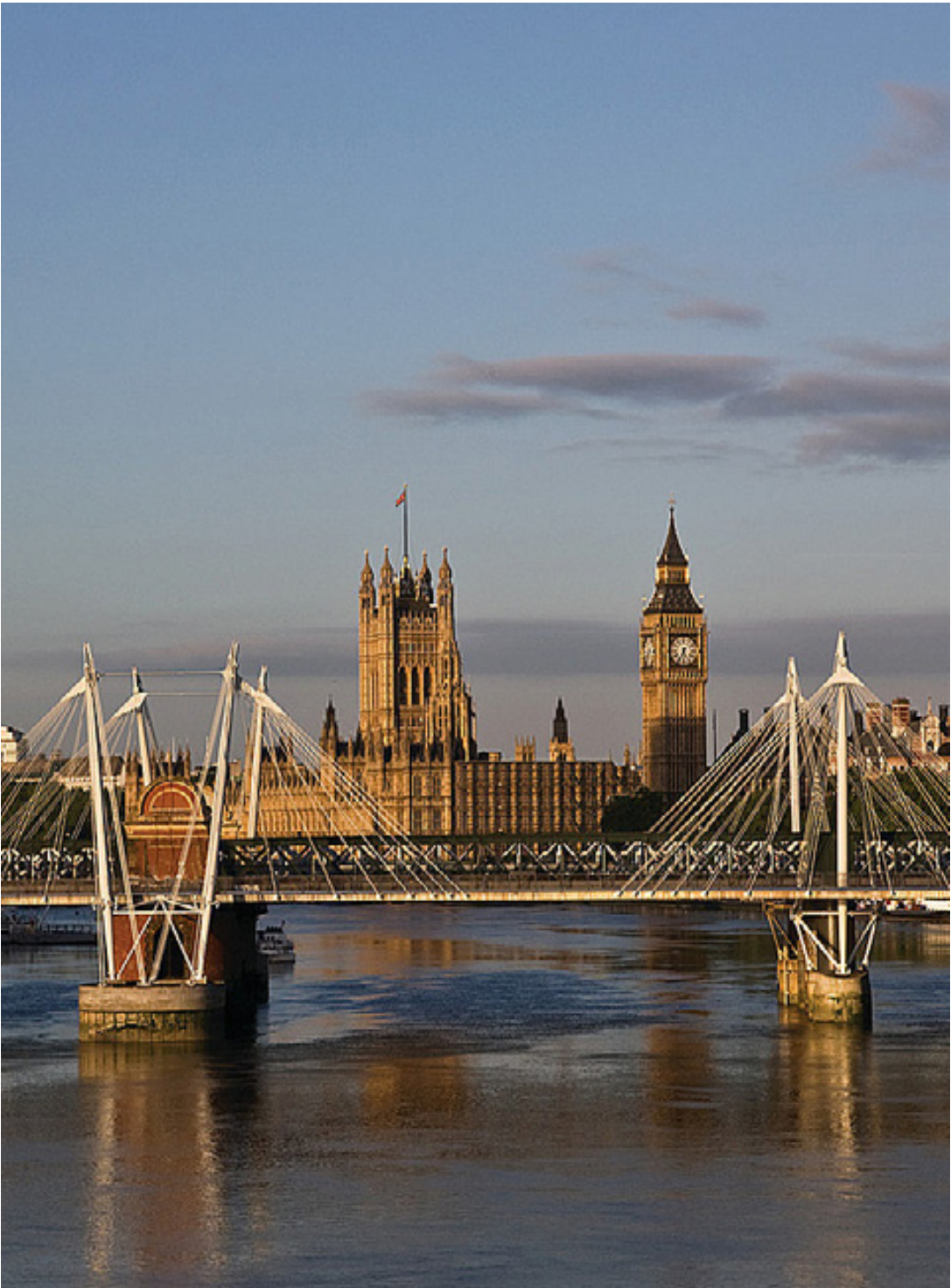
This is a sample of all the sites around London.