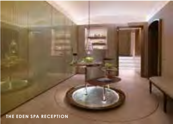
THE EDEN SPA RECEPTION