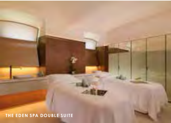
THE EDEN SPA DOUBLE SUITE

The Eden Spa has been specially designed as an oasis of calm, providing a serene space in which to relax, unwind and be pampered. Escape from the world to your own secret sanctuary. The carefully chosen selection of indulgent spa treatments will help you rejuvenate your body and spirit, in one of four private spa suites.