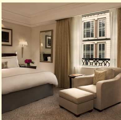
Grand Luxe Guest Room