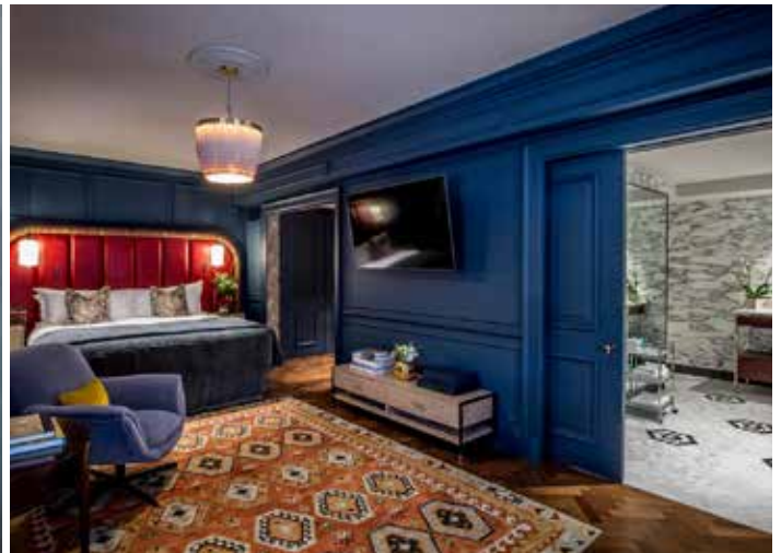
LUXURY STUDIO SUITE

The same blend of historical charm and contemporary chic that defines the hotel's aesthetic also runs through its rooms. An understated décor is blended with period architectural detail, luxurious furnishings and Italian marble bathrooms for a classic feel with a dash of modern designer flair.