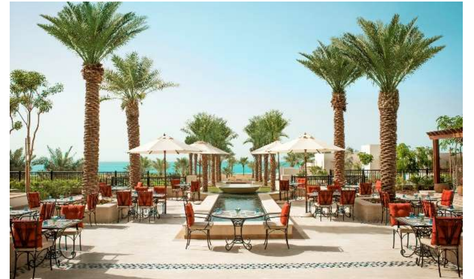
Olea – All Day Dining