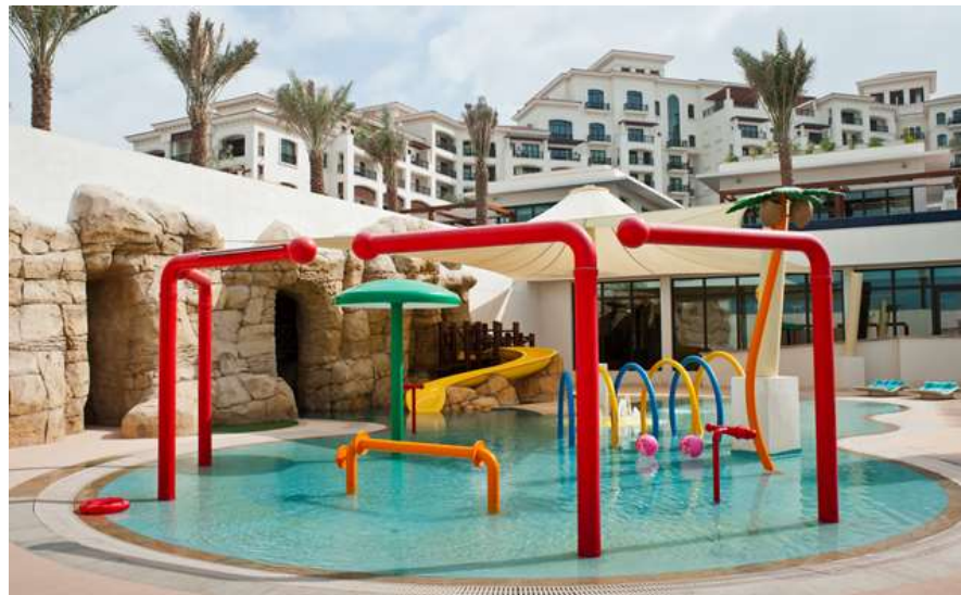
Sandcastle – Kids Club