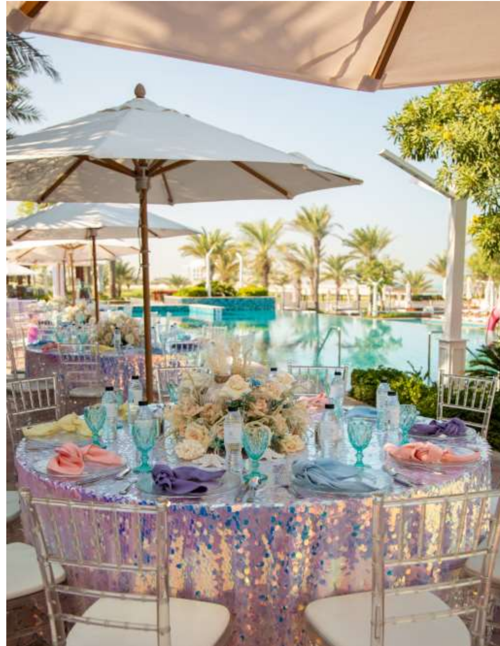
Main Pool Group Lunch