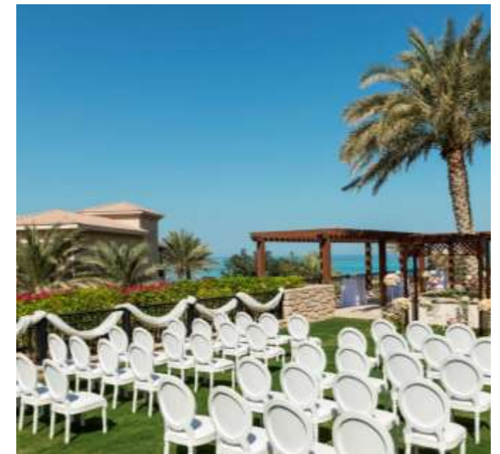
Top Image Beach Breeze Lawn Bottom Regal Terrace