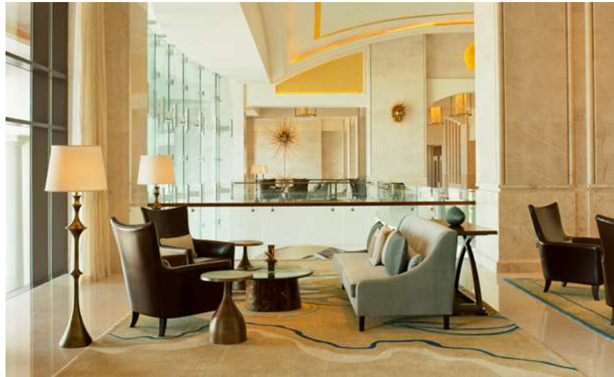
The Drawing Room – Coffee Shop