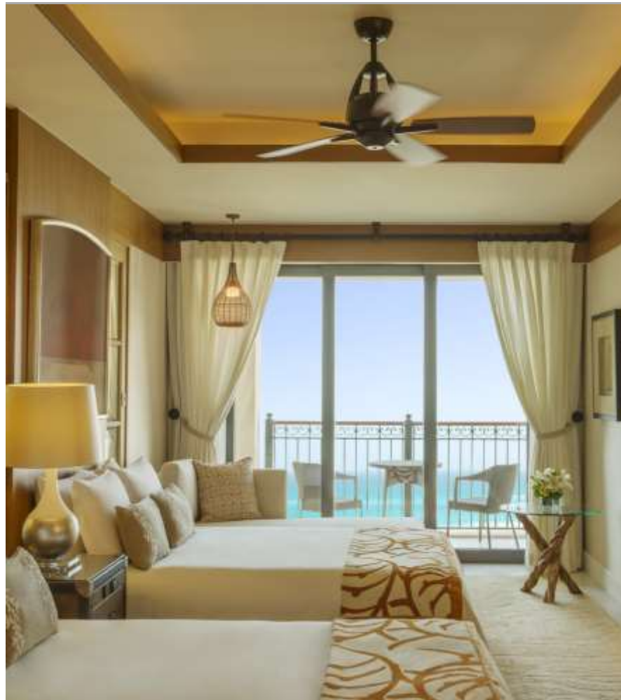
Premium Sea View

64 suites – from 85sqm suites to our Royal Suite 2100sqm.