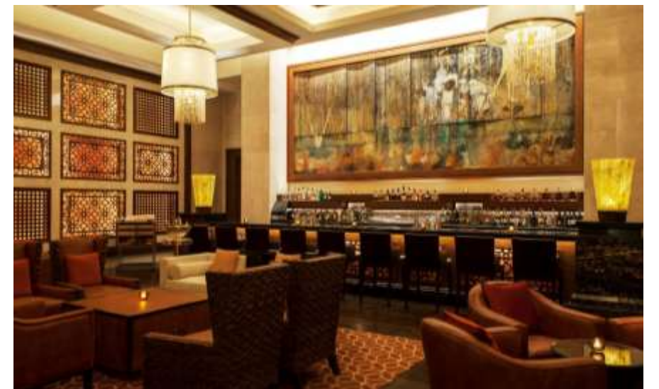
Manhattan Bar – St. Regis Bar