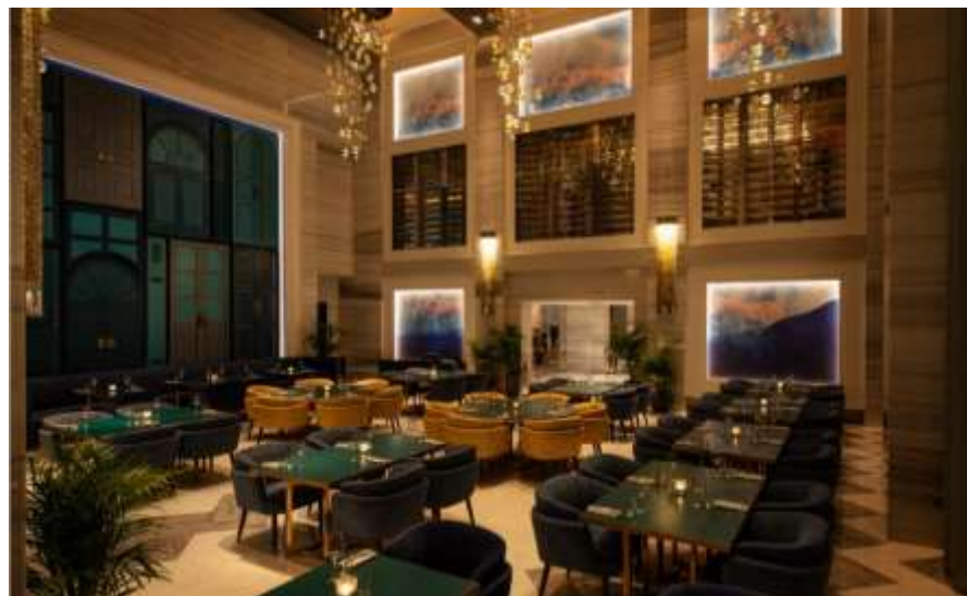
Mazi - Greek