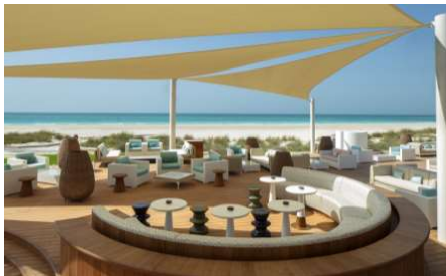
Buddha Bar Beach – Asian Fusion