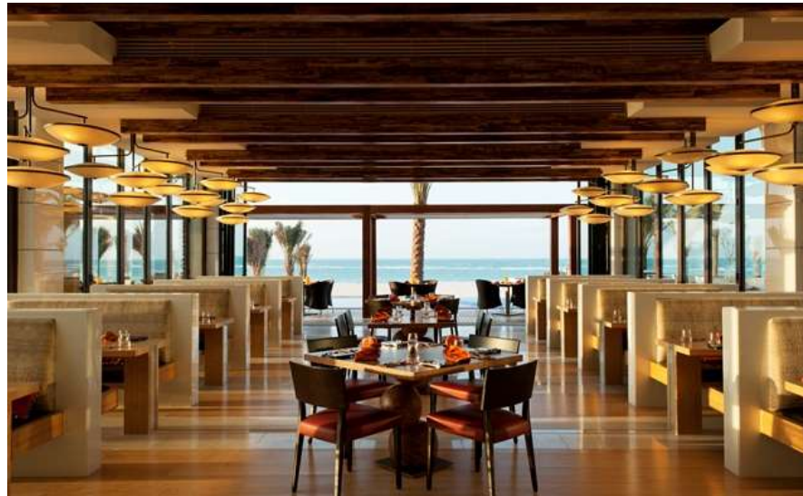
Sontaya – Pan Asian