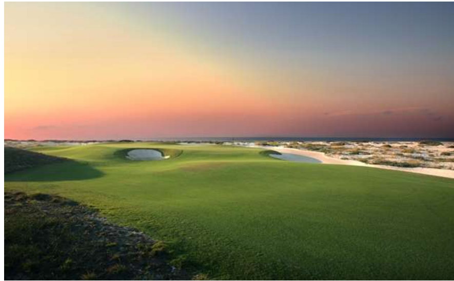
Saadiyat Country Club – Golf Course (18)