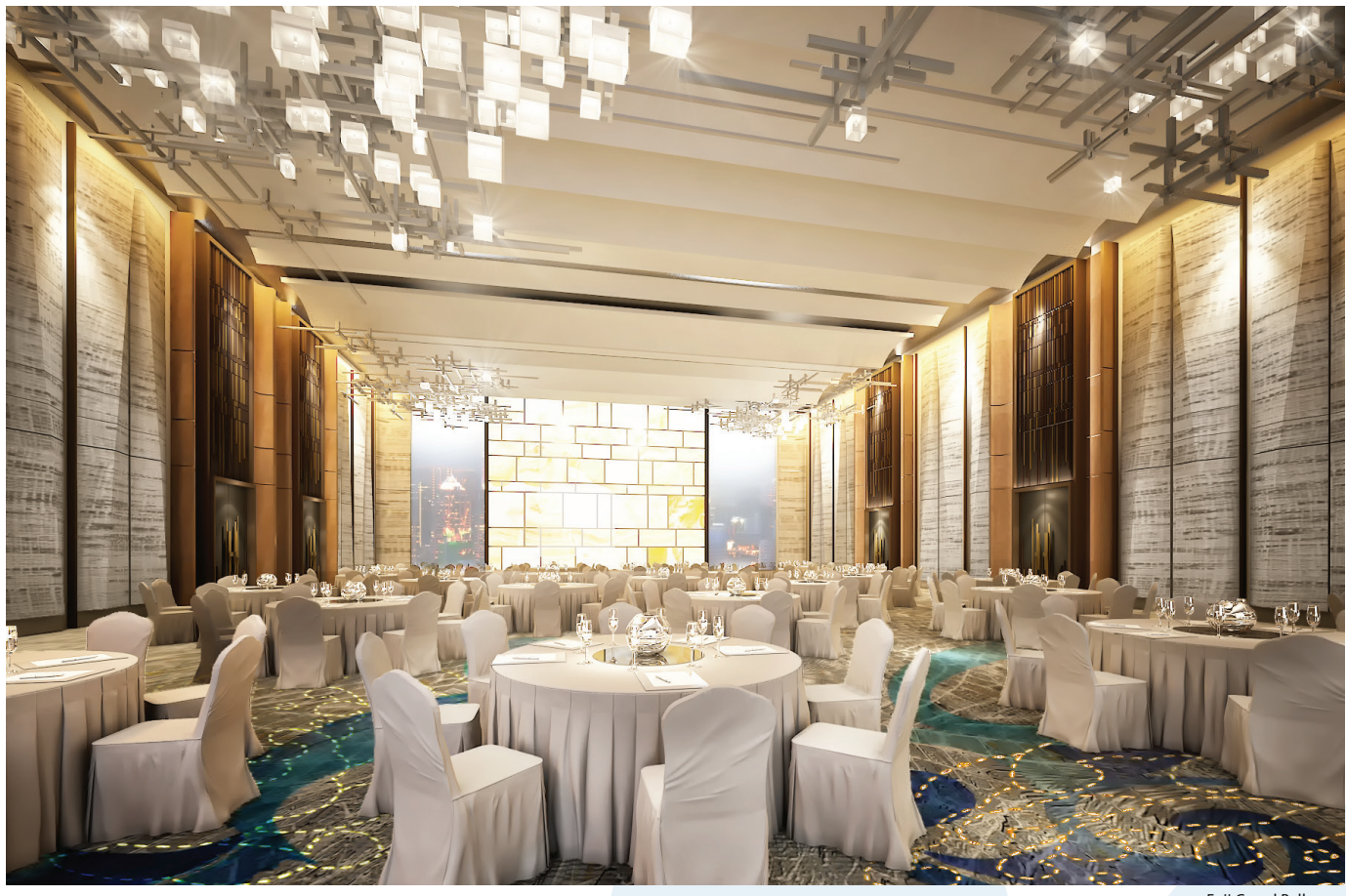
Fuji Grand Ballroom