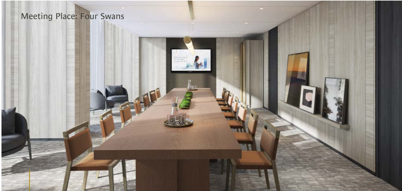
Meeting Place: Four Swans