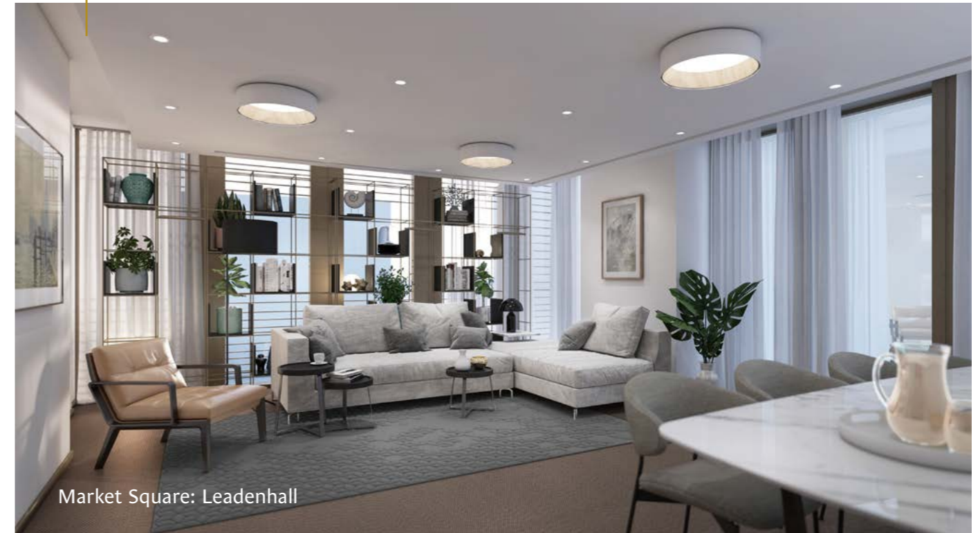
Market Square: Leadenhall

Market Square is a relaxed creative meeting space on level three, consisting of four meeting rooms named after local London markets within the Market Mile. Each room is equipped with access to the latest technology, including 4K LED screens and video conferencing facilities. The central breakout space, known as Market Kitchen, is well-stocked with snacks and drinks - giving you flexibility and choice to help yourself throughout the day. This floor is hired exclusively to provide you with privacy.