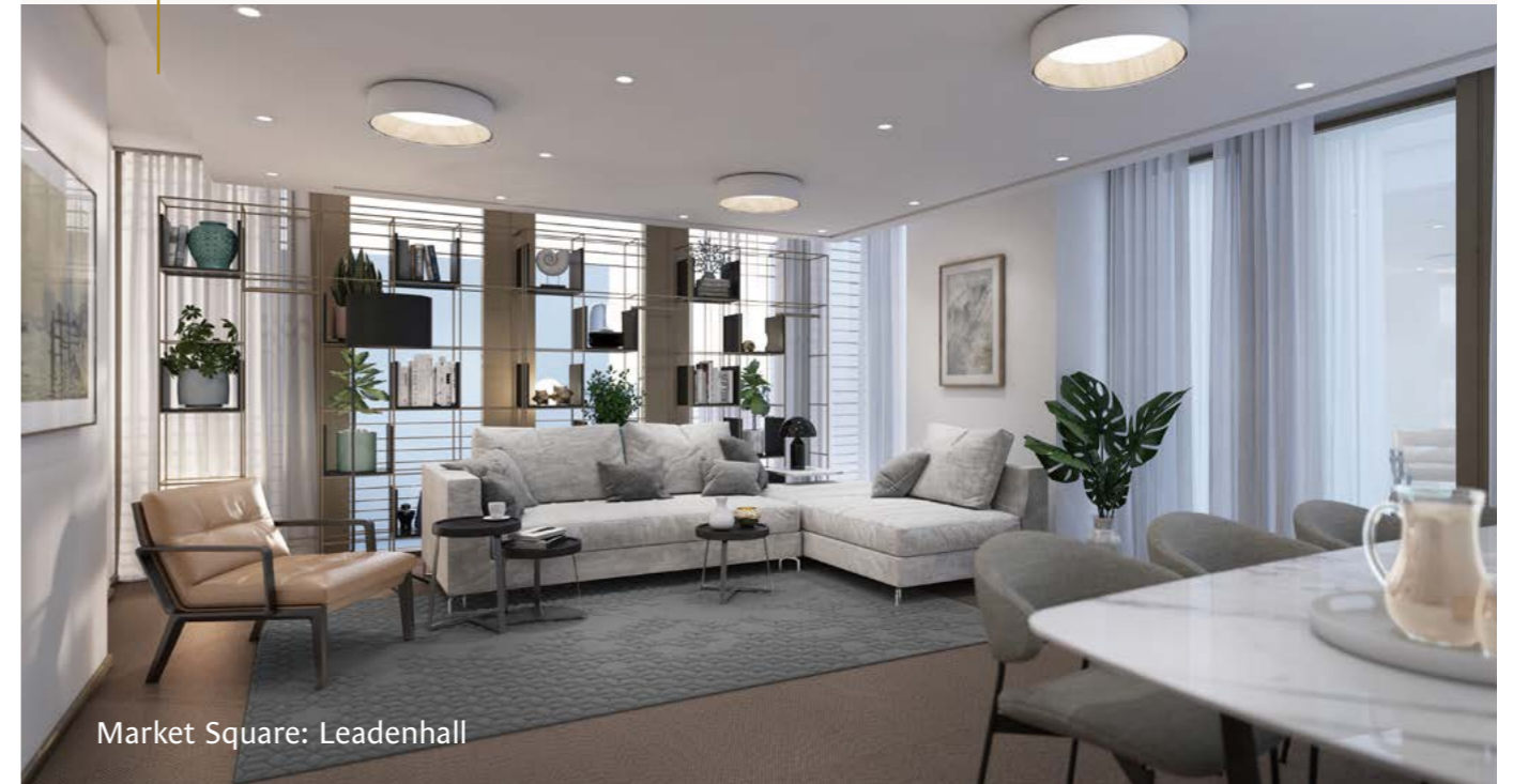
Market Square: Leadenhall

Market Square is a relaxed creative meeting space on level three, consisting of four meeting rooms named after local London markets within the Market Mile. Each room is equipped with access to the latest technology, including 4K LED screens and video conferencing facilities. The central breakout space, known as Market Kitchen, is well-stocked with snacks and drinks - giving you flexibility and choice to help yourself throughout the day. This floor is hired exclusively to provide you with privacy.