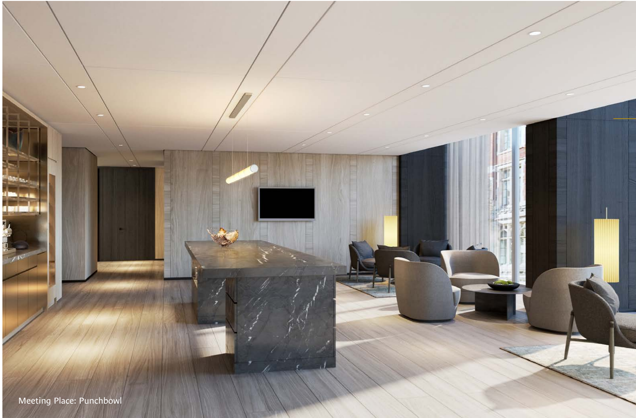
Meeting Place: Punchbowl