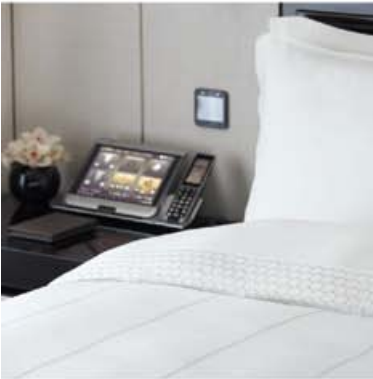
In- room technology