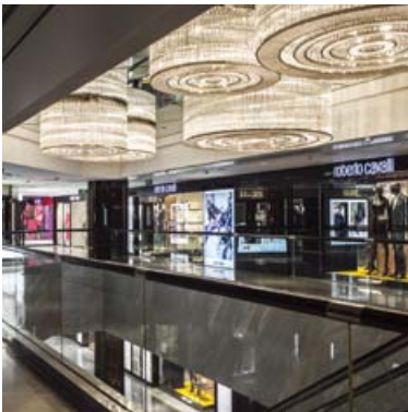
The Peninsula Arcade