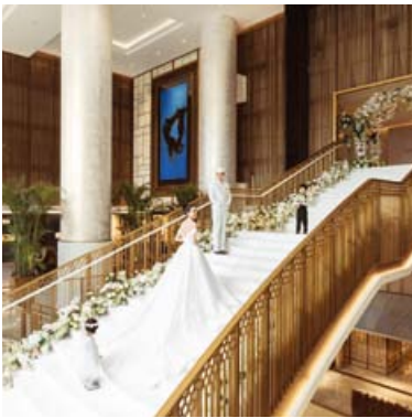
Wedding at The Peninsula Beijing