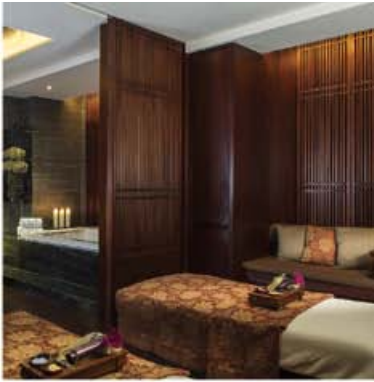
The Peninsula Spa