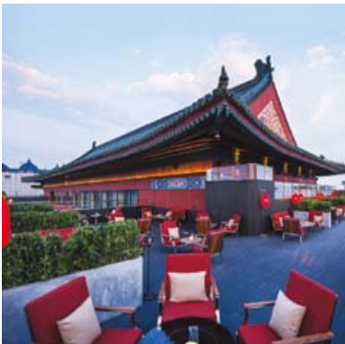
The Peninsula Yun

Lunch: 11:30 am – 2:30 pm Dinner: 6:00 pm – 10:30 pm Tea House: 11:00 am – 10:30 pm Tel: +86 10 8516 2888 ext. 6757 Dress Code: Smart Casual