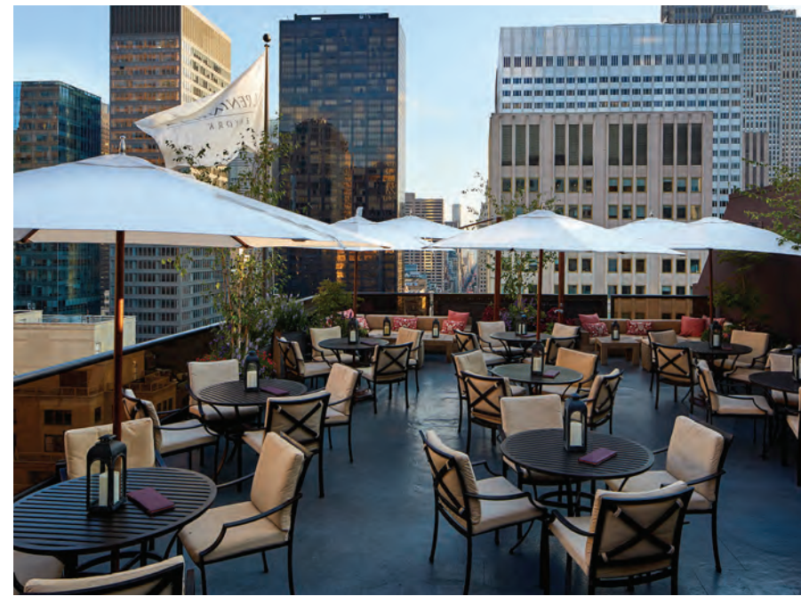
SALON DE NING