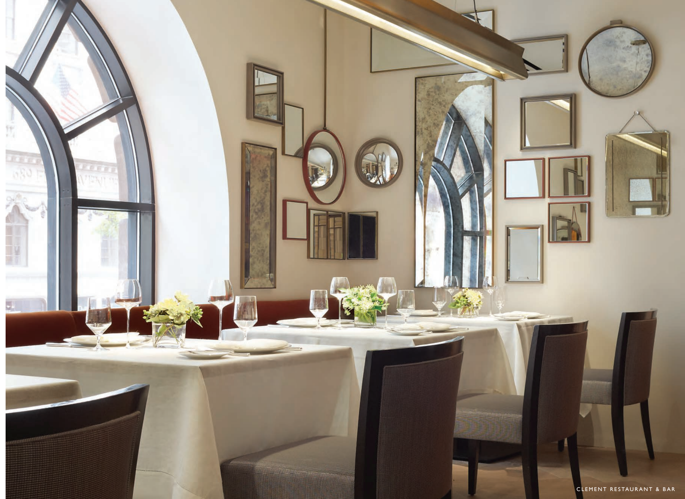
CLEMENT RESTAURANT & BAR