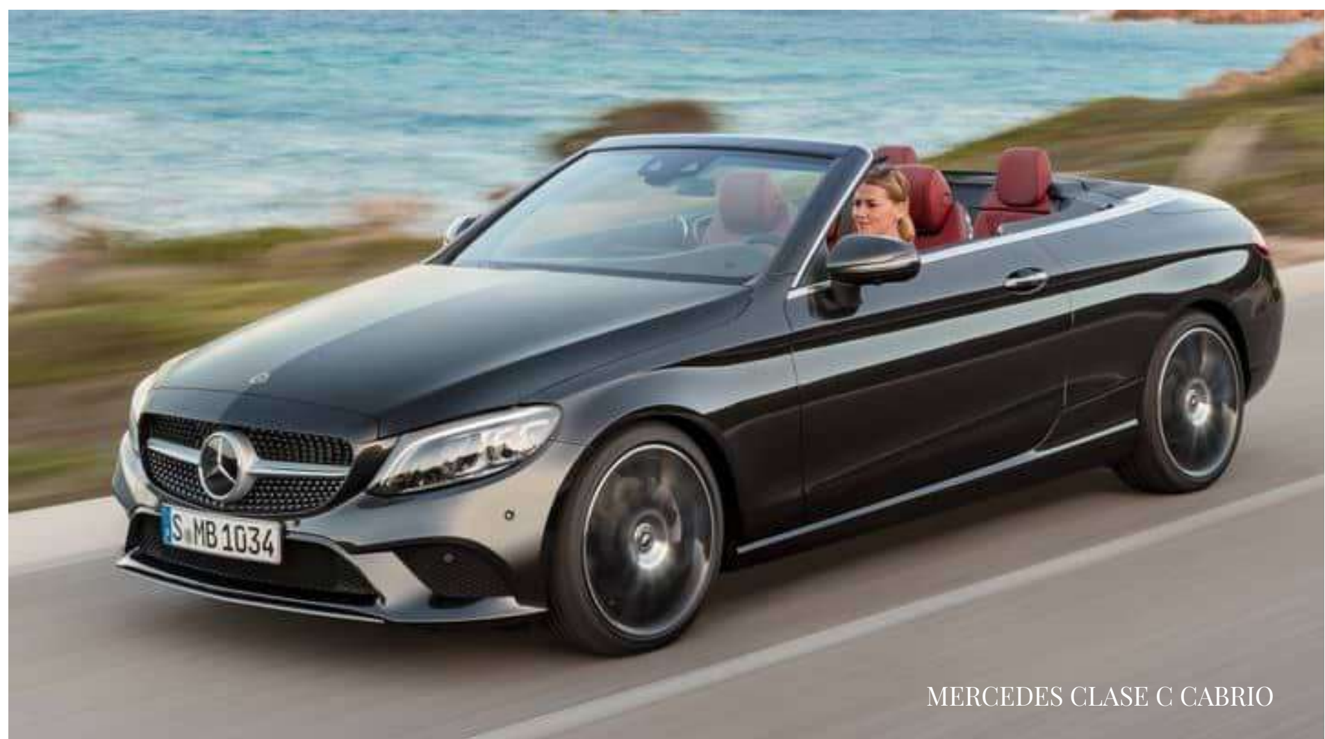
MERCEDES CLASE C CABRIO