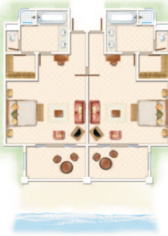
Deluxe Family Apartment