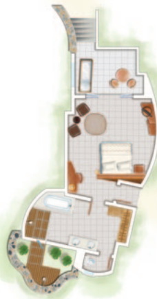
Tropical Junior Suite