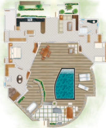
Pool Villa I