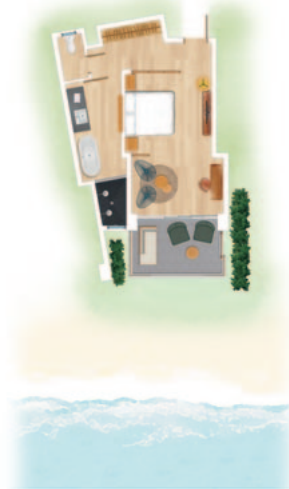
Ocean View Room