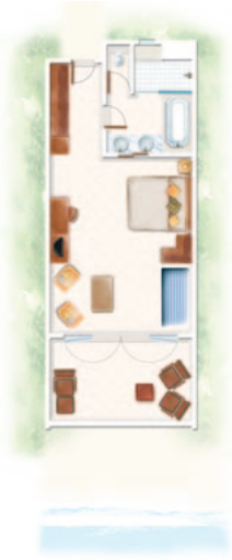
Superior Room First Floor