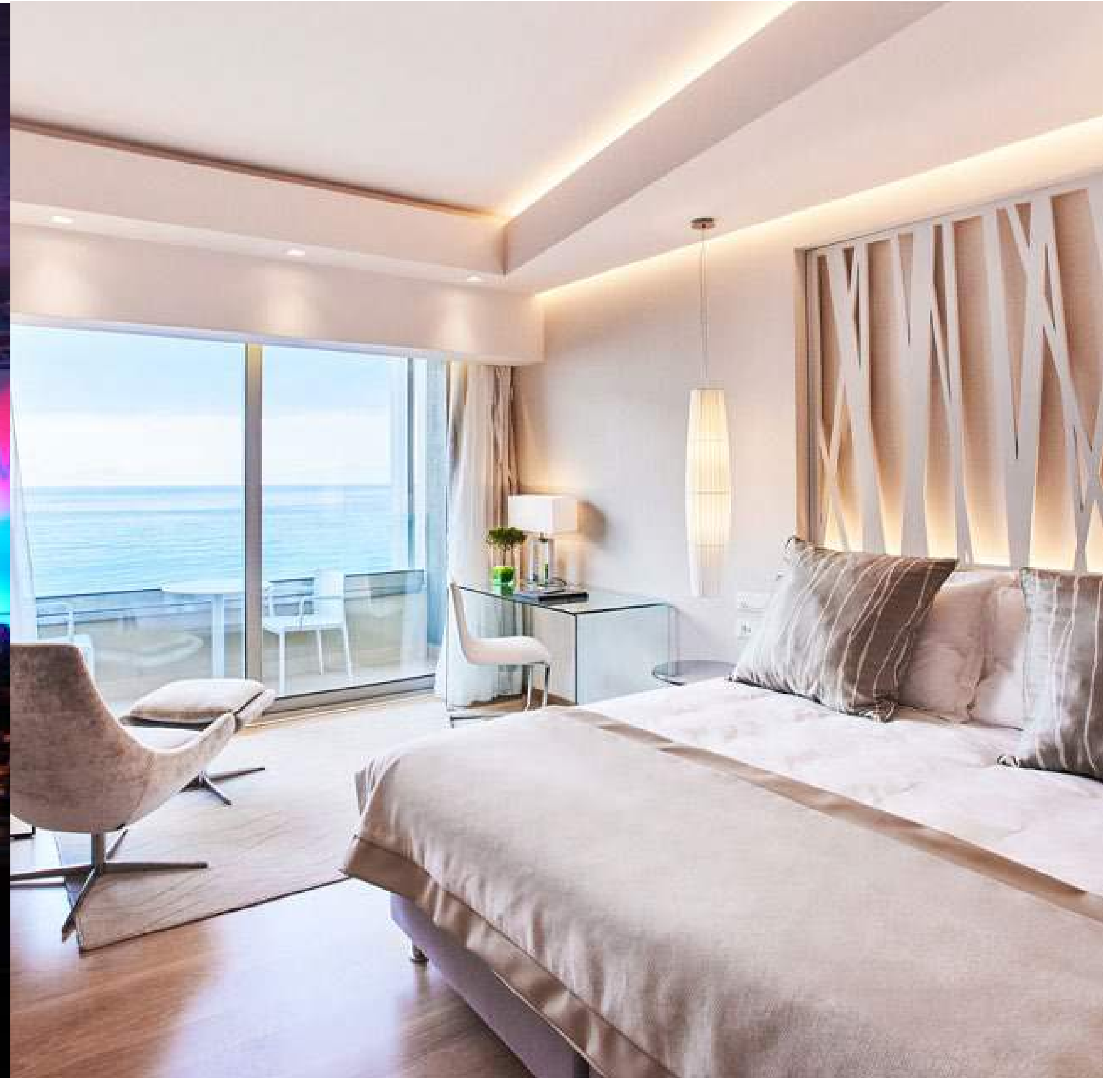
Event at Zeus Hall, Rodos Palace