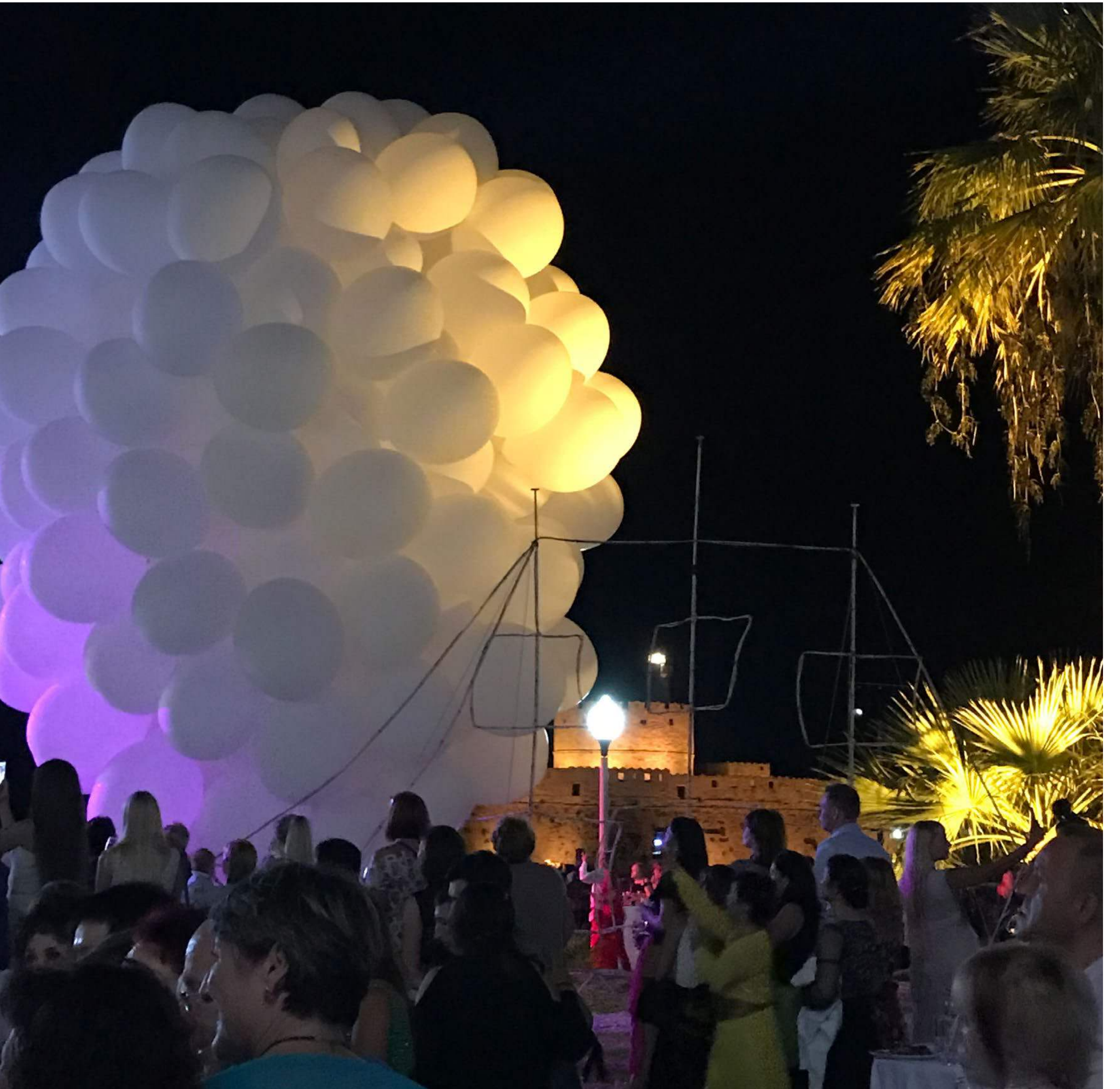
Center stage at Kountouriotou Square