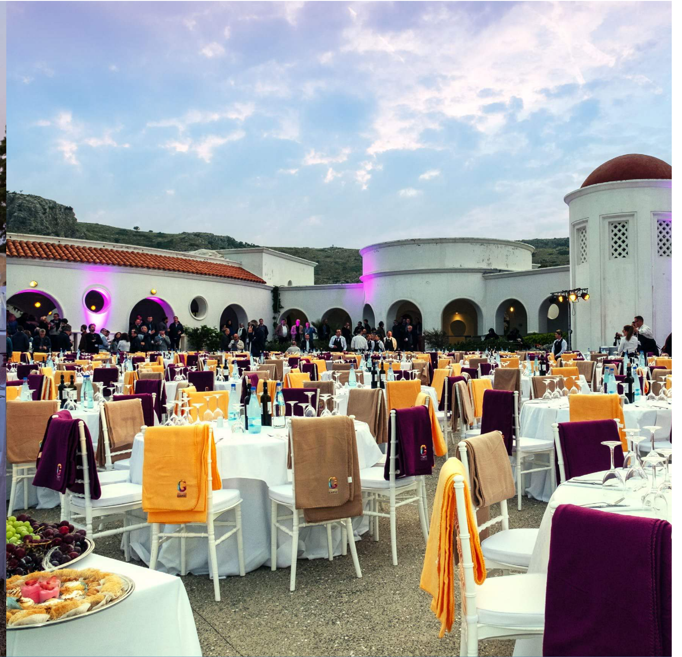
Banquet at Kallithea Springs