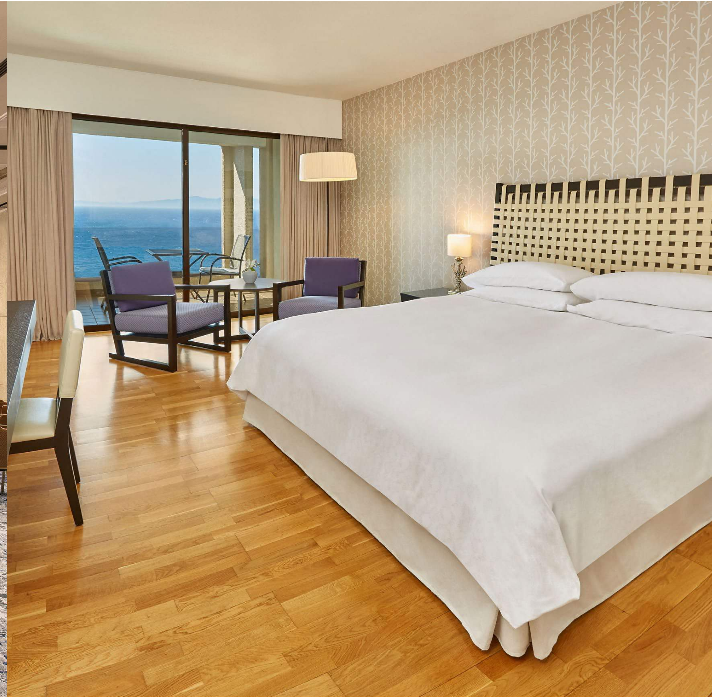
Panoramic Sea View Room, Sheraton Rhodes Resort