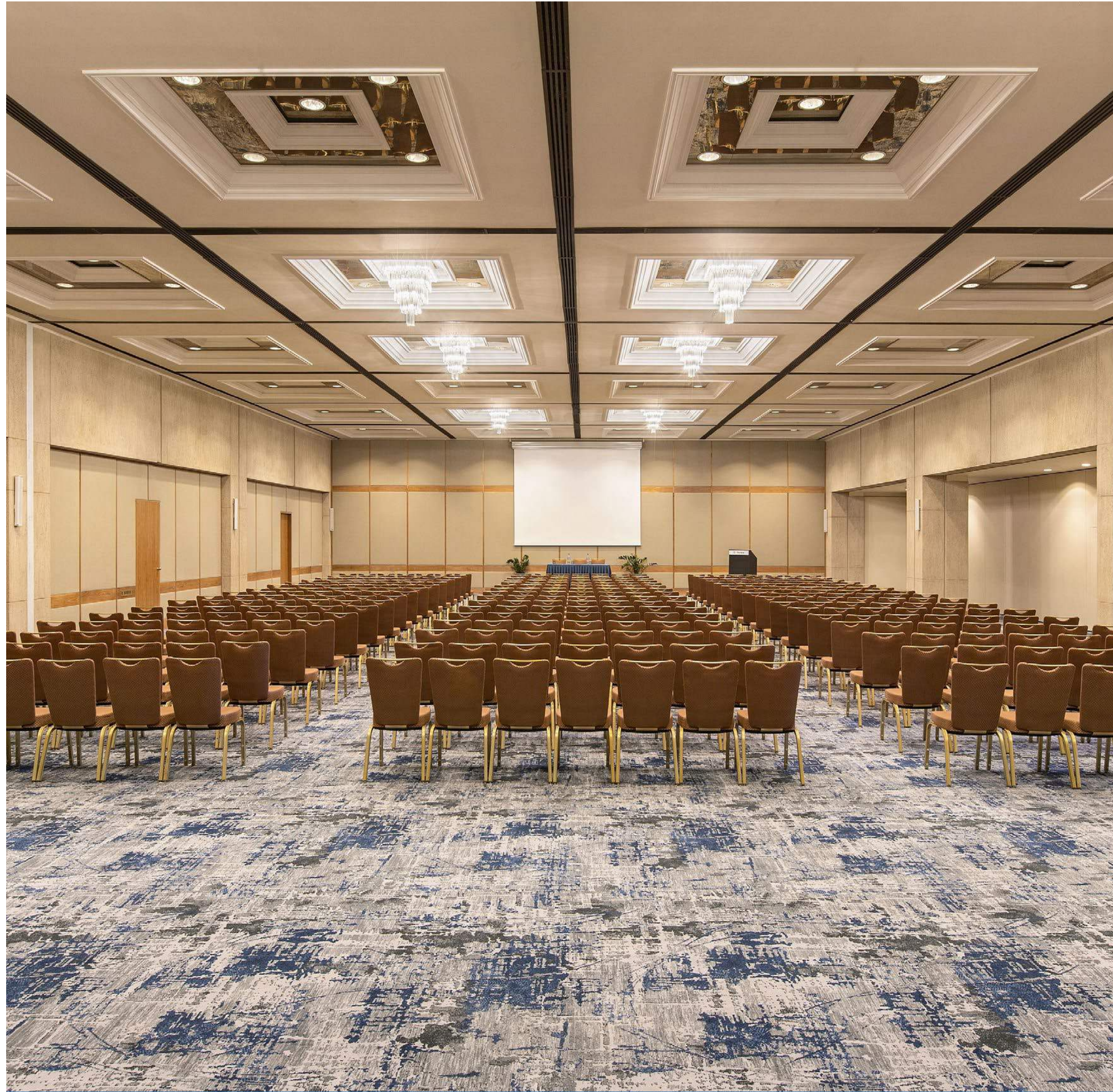
Imperial Ballroom, Sheraton Rhodes Resort