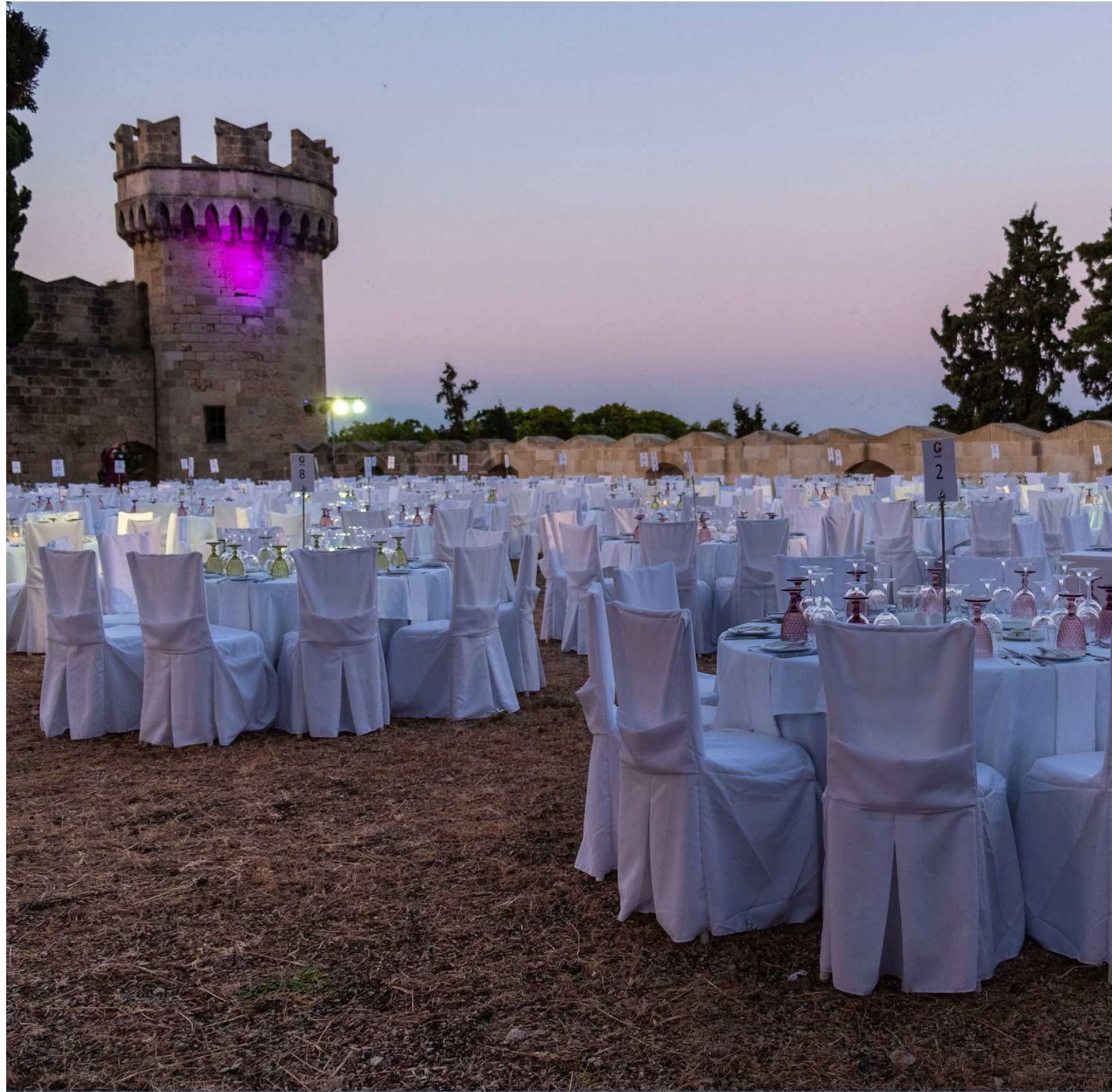
Banquet at the Bastion of the Palace of the Knights