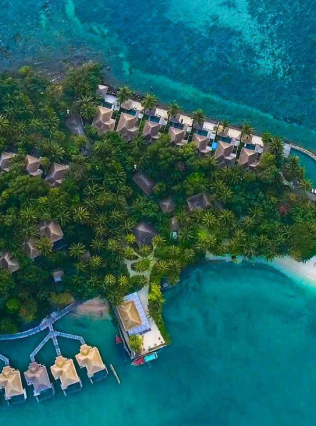
Song Saa Private Island Koh Rong – Cambodia 24 Rooms