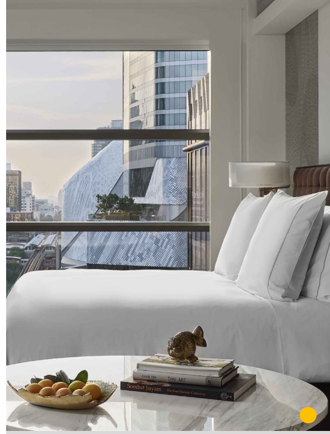
Rosewood Bangkok - Thailand 158 Rooms