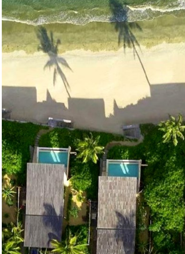
Six Senses Con Dao Vietnam 50 Villas