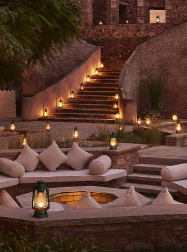
Six Senses Fort Barwara Rajasthan 48 Rooms