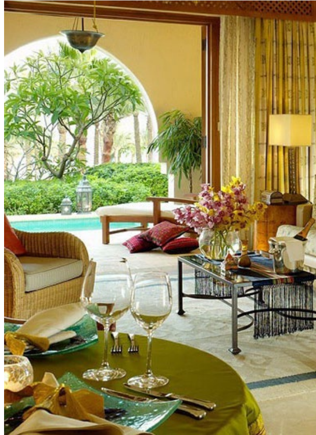
Four Season Sharm El Sheikh 520 Rooms