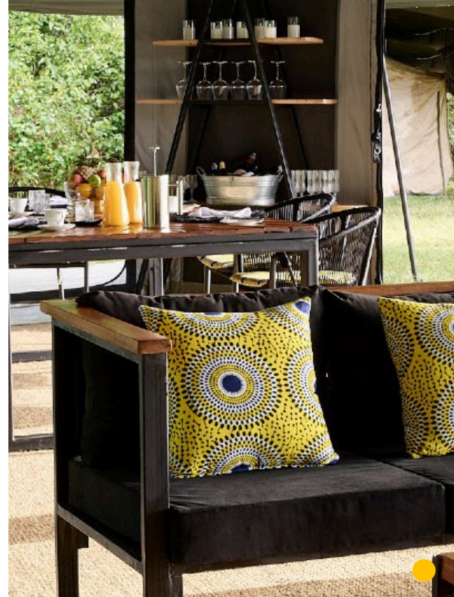
A&K Exclusive Camps Masai Mara & Ol Pejeta 12 Tents