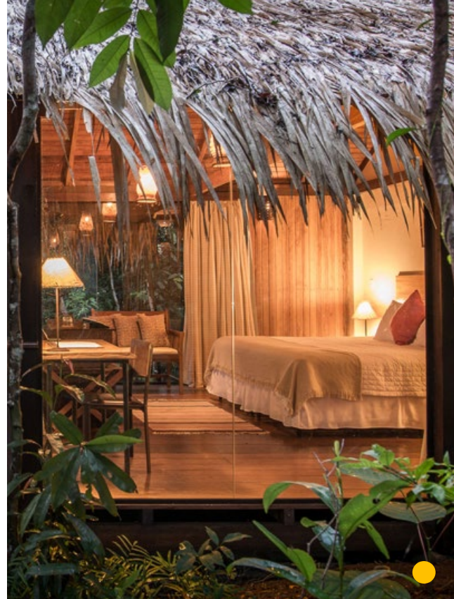
Anavilhanas Jungle Lodge Amazonia 22 Rooms