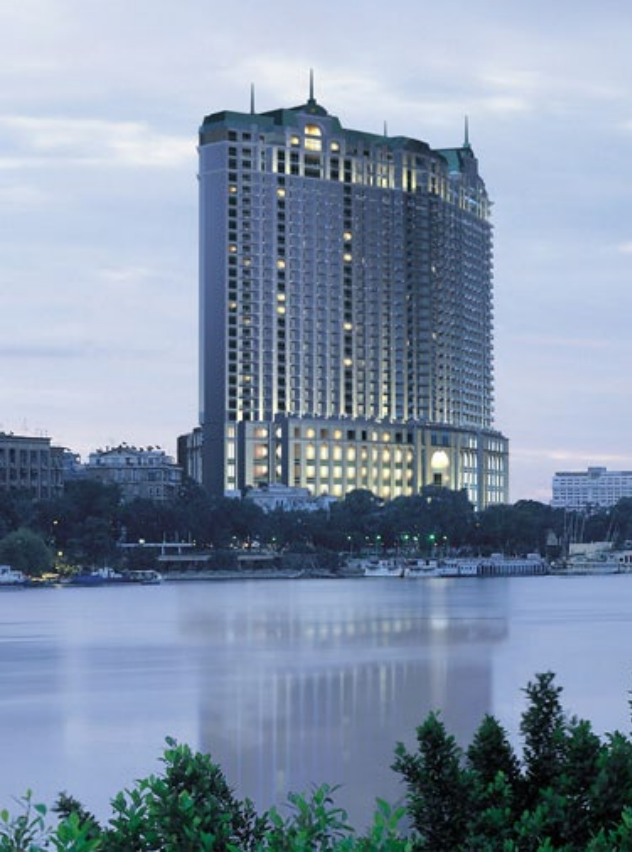
Four Seasons Nile Plaza Cairo 366 Rooms