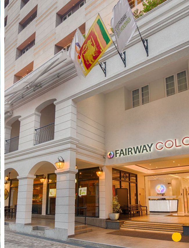
The Fairway Colombo Colombo 181 Rooms