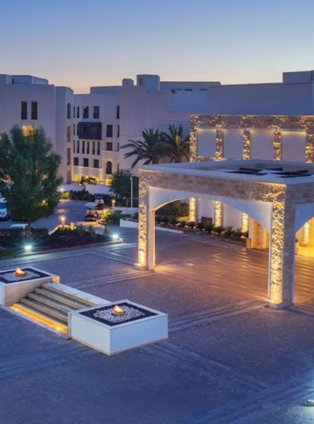
Hilton Resort & Spa Dead Sea 285 Rooms