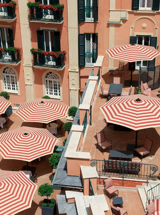
Hotel de la Ville Rome 104 Rooms