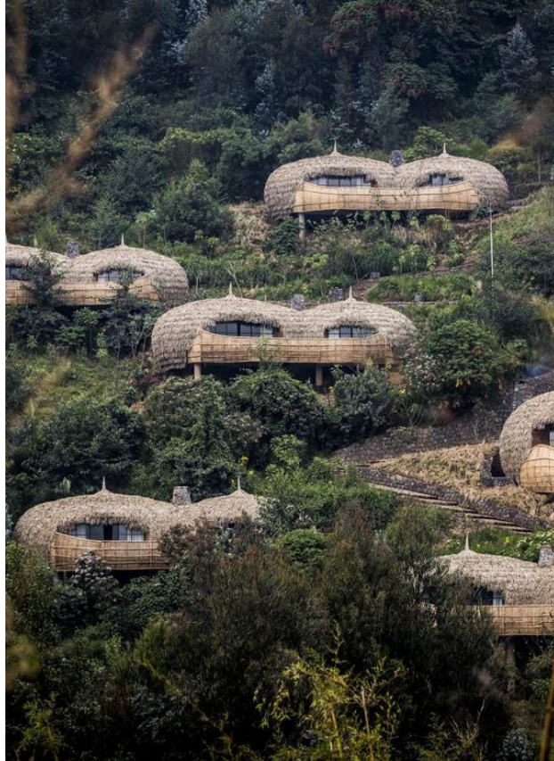
Bisate Lodge Rwanda 6 suites