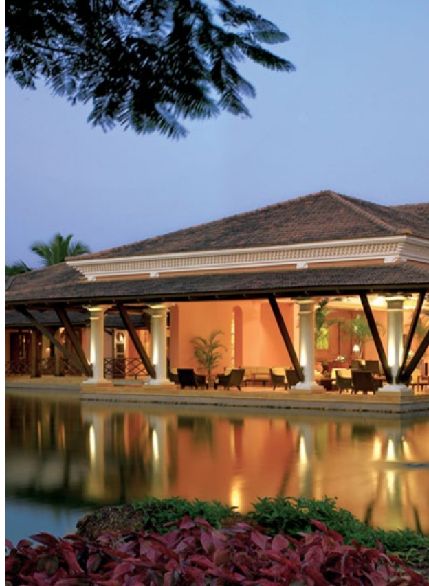
Park Hyatt Goa 251 Rooms