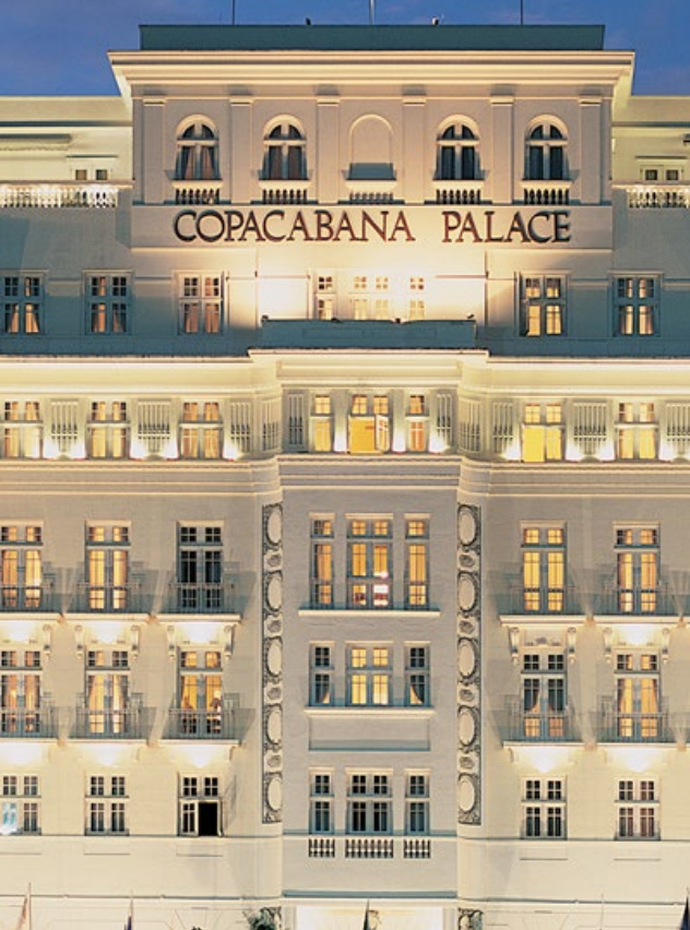
Belmond Copacabana Rio de Janeiro 239 Rooms