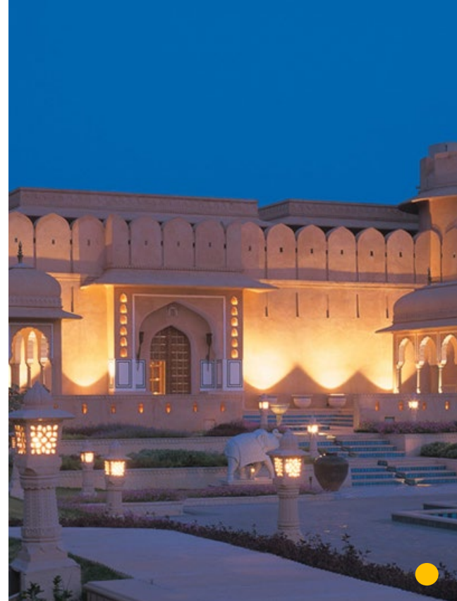
The Oberoi Rajvilas Jairpur 71 Rooms