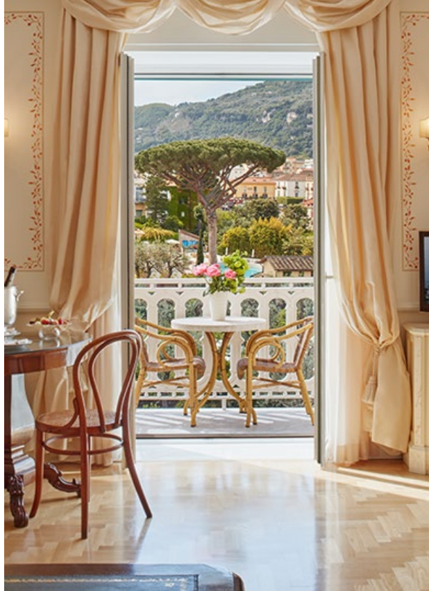
Grand Hotel Excelsior Vittoria – Sorrento 84 Rooms