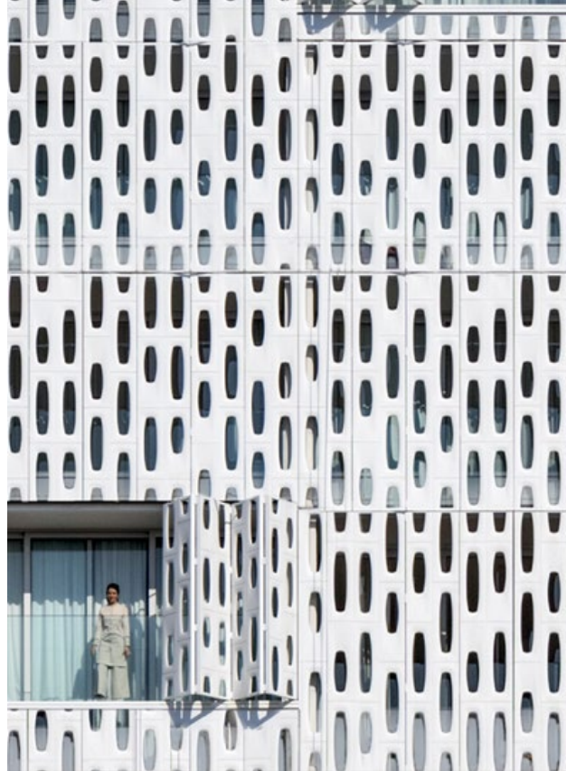
Emiliano Rio de Janeiro 90 Rooms