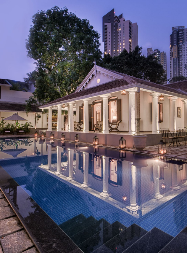
Uga Residence Colombo 11 Rooms