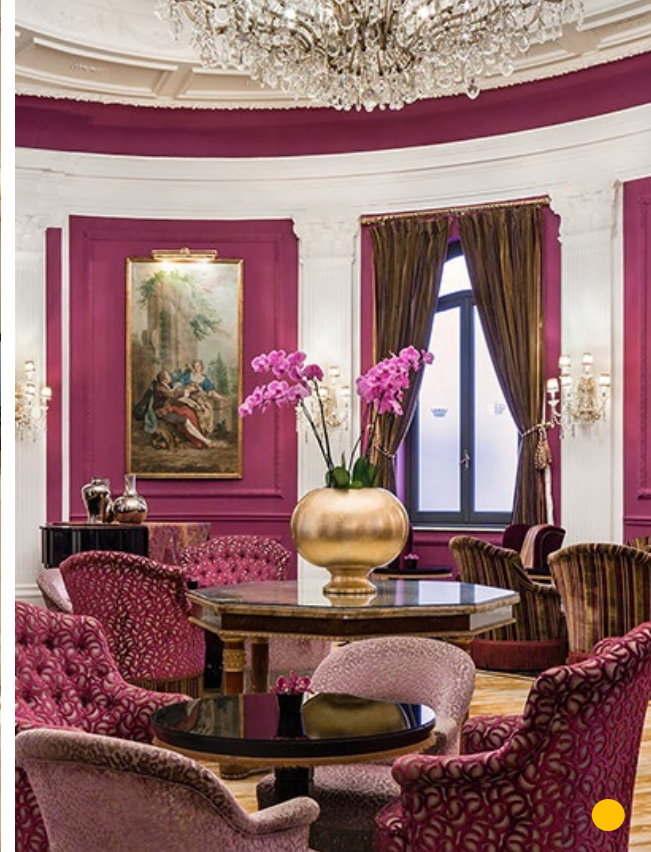
Baglioni Hotel Regina Rome 116 Rooms