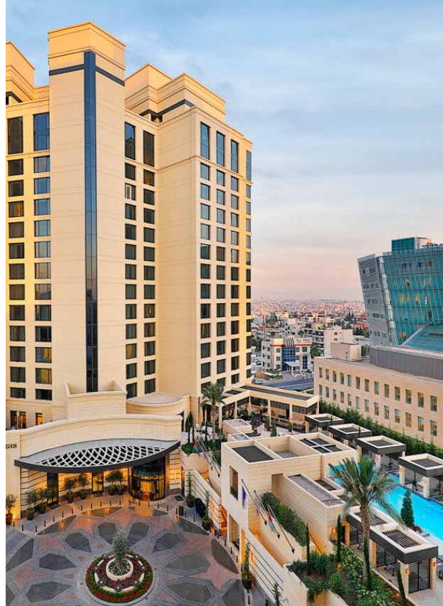
St Regis Amman 258 Rooms