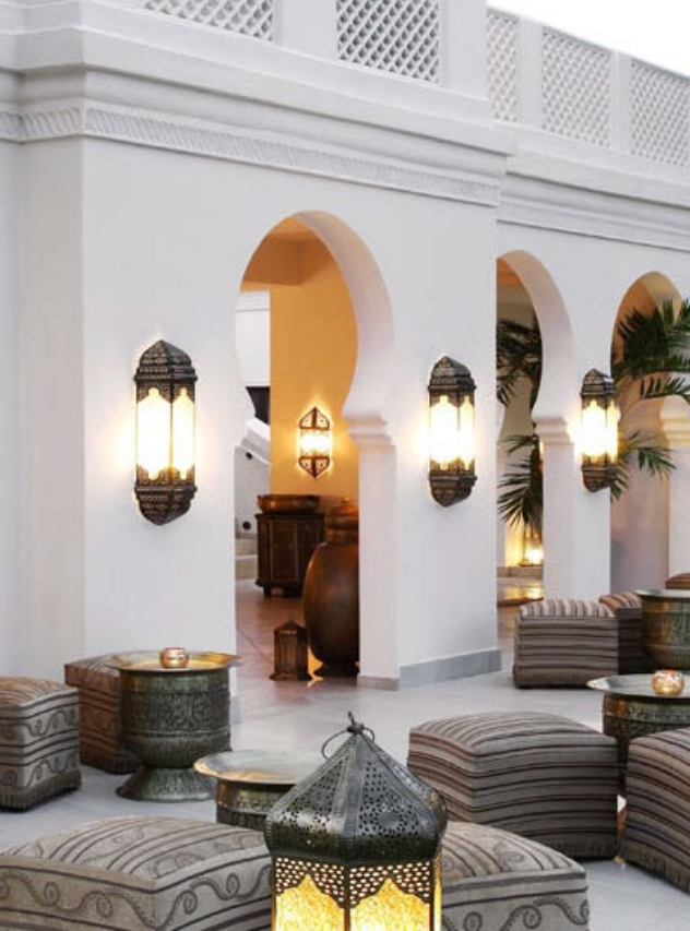
Baraza Beach Resort Zanzibar 30 Rooms