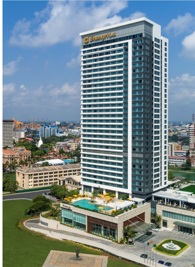
Shangri-La Colombo Colombo 500 Rooms