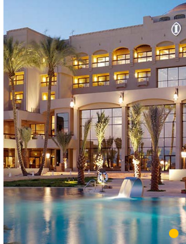
InterContinental Aqaba 255 Rooms